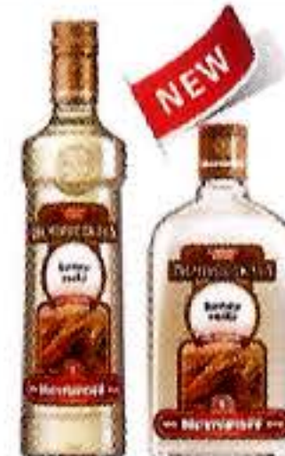
NEMIROVSKAYA HONEY RUSKS