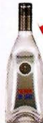
PREMIUM DE LUXE