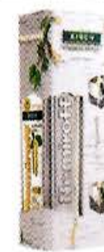
UKRAINIAN BIRCH SPECIAL