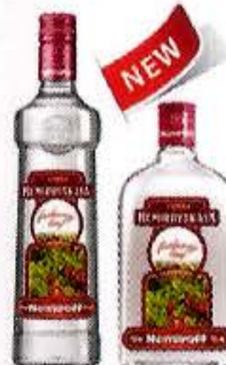
NEMIROVSKAYA FOXBERRY LEAF