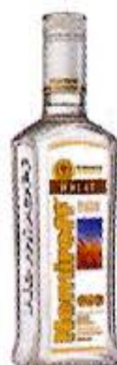
UKRAINIAN WHEAT SELECTED