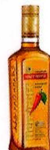
UKRAINIAN HONEY PEPPER