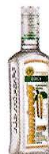
UKRAINIAN BIRCH SPECIAL