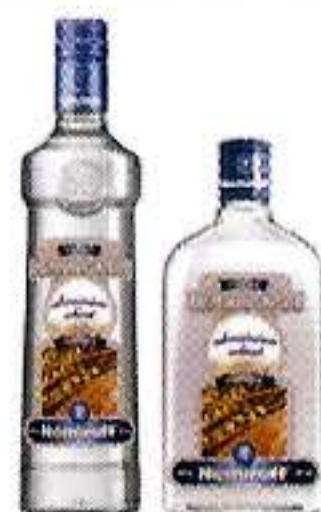
NEMIROVSKAYA UKRAINIAN WHEAT SELECTED