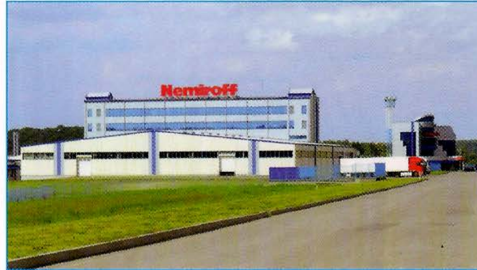
NEW NEMIROFF DISTILLERY

Today, Nemiroff is one of the world spirits market leaders.