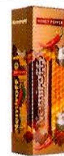
UKRAINIAN HONEY PEPPER